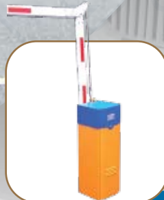
Folding arm 90°